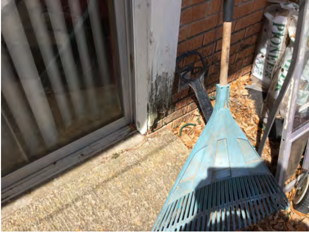
6/8/2017 4:56:42 PM

Project Number: CD-12937 Address: 4411 3rd Inspection Date: 6/8/2017