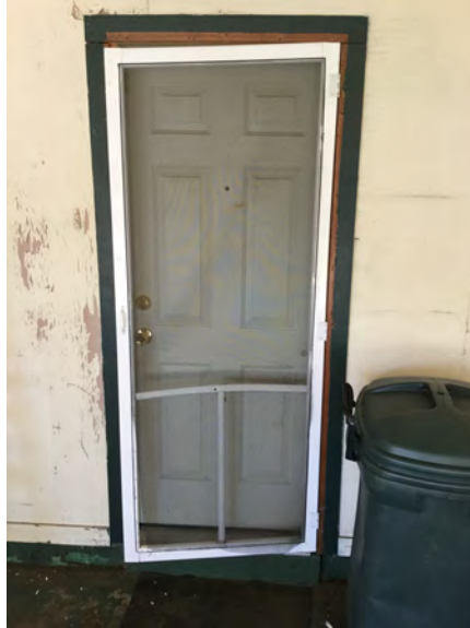
6/8/2017 4:56:13 PM