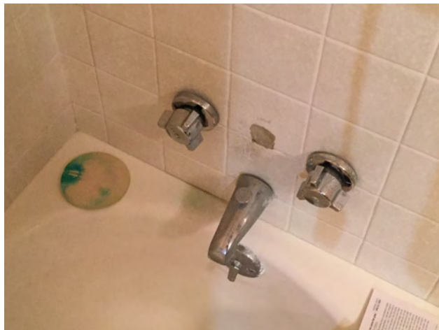
6/26/2017 10:50:42 AM