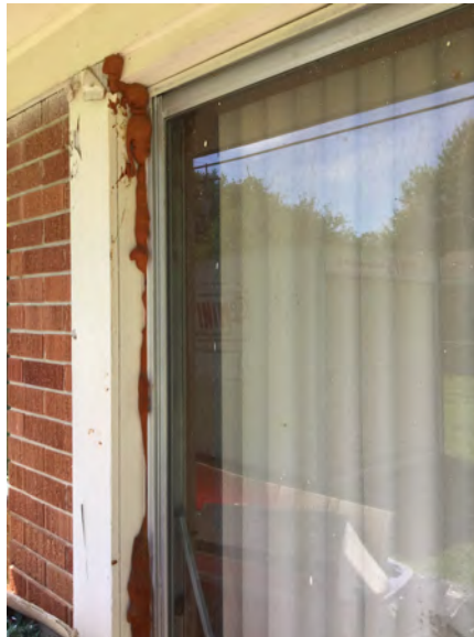
6/8/2017 4:56:44 PM