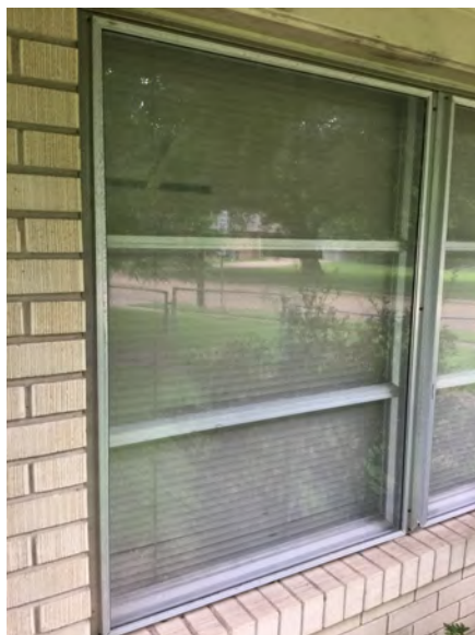
6/23/2017 8:52:54 AM

Project Number: CD-12947 Address: 2903 ELLBEE Inspection Date: 6/23/2017