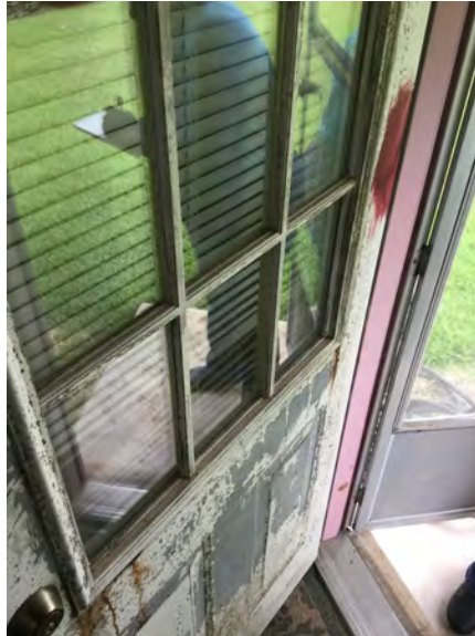
6/20/2017 1:15:26 PM