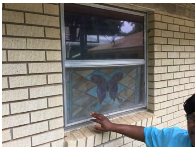
6/23/2017 8:58:55 AM