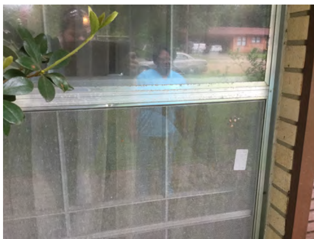
6/23/2017 8:58:50 AM