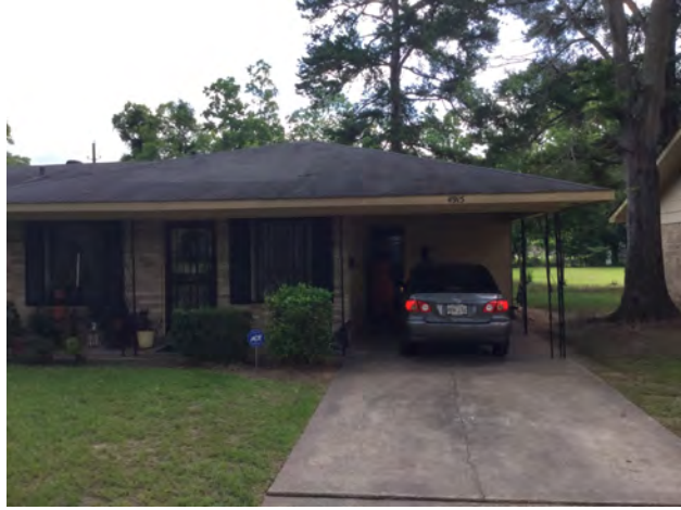
6/20/2017 7:50:45 AM