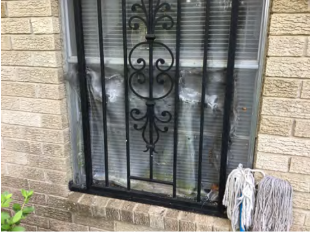
6/20/2017 7:51:05 AM

Project Number: CD-12936 Address: 4915 E. Sandy Bayou Inspection Date: 6/20/2017