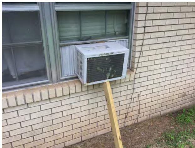
6/23/2017 8:52:47 AM