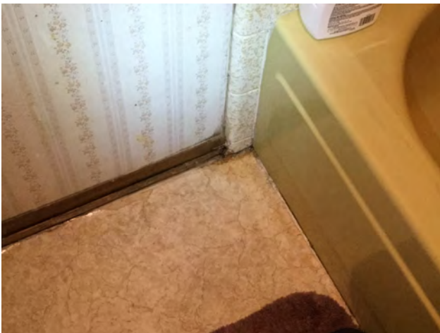
6/26/2017 10:50:55 AM