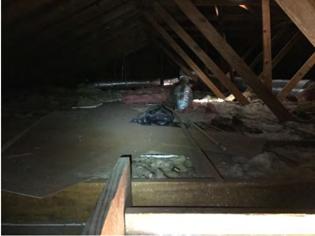
6/26/2017 10:49:45 AM

Project Number: CD-12951 Address: 3005 DOE RUN Inspection Date: 6/26/2017