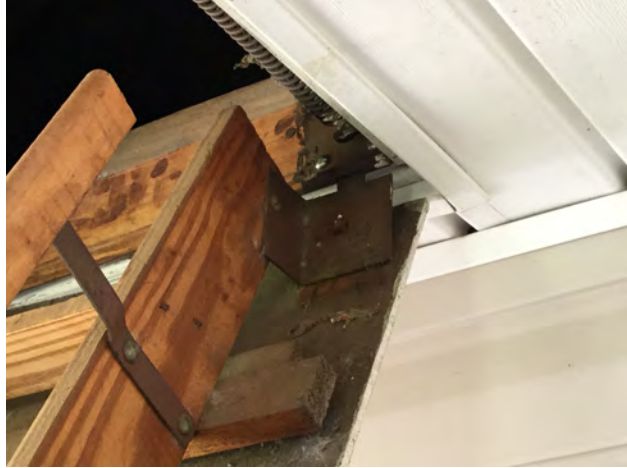
6/26/2017 10:49:44 AM