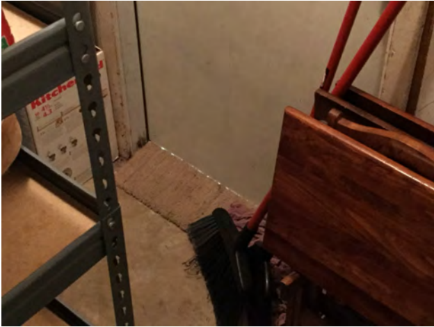
6/20/2017 1:15:28 PM

Project Number: CD-12941 Address: 3228 BELWOOD Inspection Date: 6/20/2017