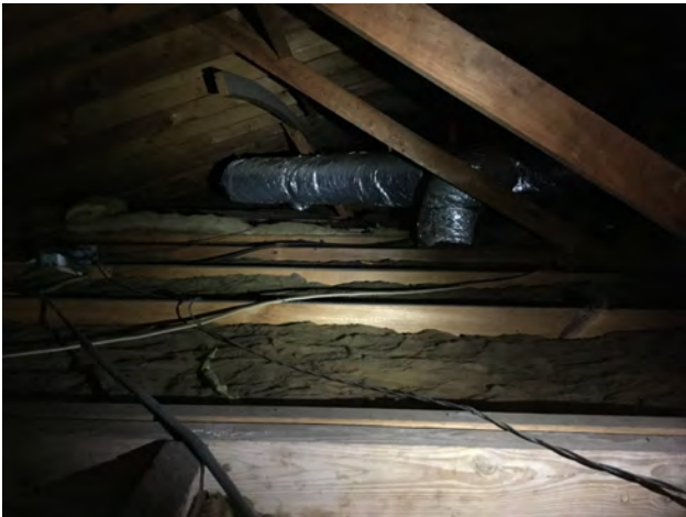
6/20/2017 1:15:42 PM